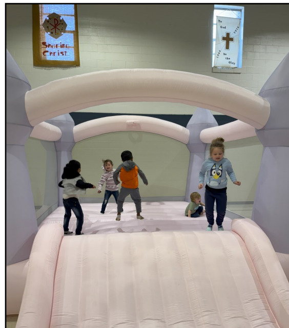
Right: Preschool Bounce House Day in Holy Cross gym.