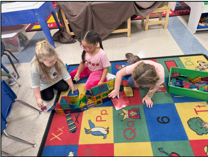
Above: Preschool friends build together.